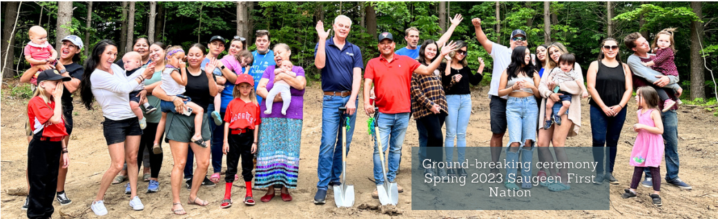
Ground-breaking ceremony Spring 2023 Saugeen First Nation

"I wouldn't have been able to do any of this without my mom. It was a lot of work to get your volunteer hours but I'm happy I came and now I wish I was there even more. Everyone was really nice and made it comfortable. It was a really good work environment. It was a lot of work but it was so worth it in the end and a lot of fun."